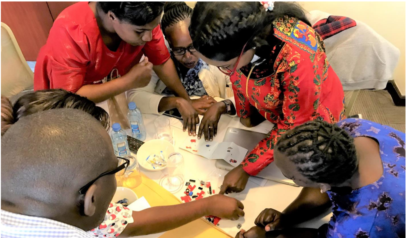
LARC learning session in Kenya